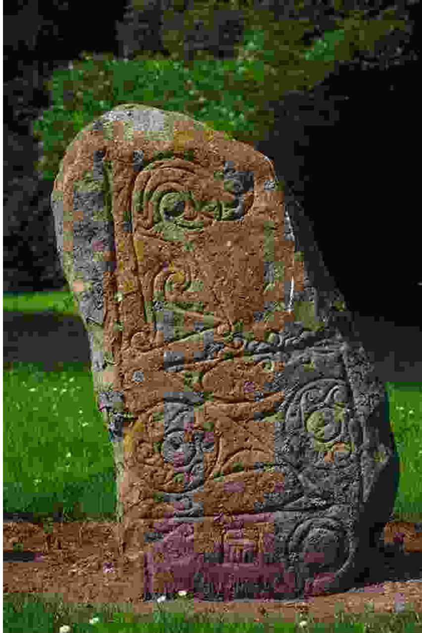
Pictish symbols at Clava Cairns

Archaeological investigations have uncovered evidence of cremation rituals and ceremonial practices at the Clava Cairns. It is believed that the cairns served as communal burial grounds, where the remains of deceased