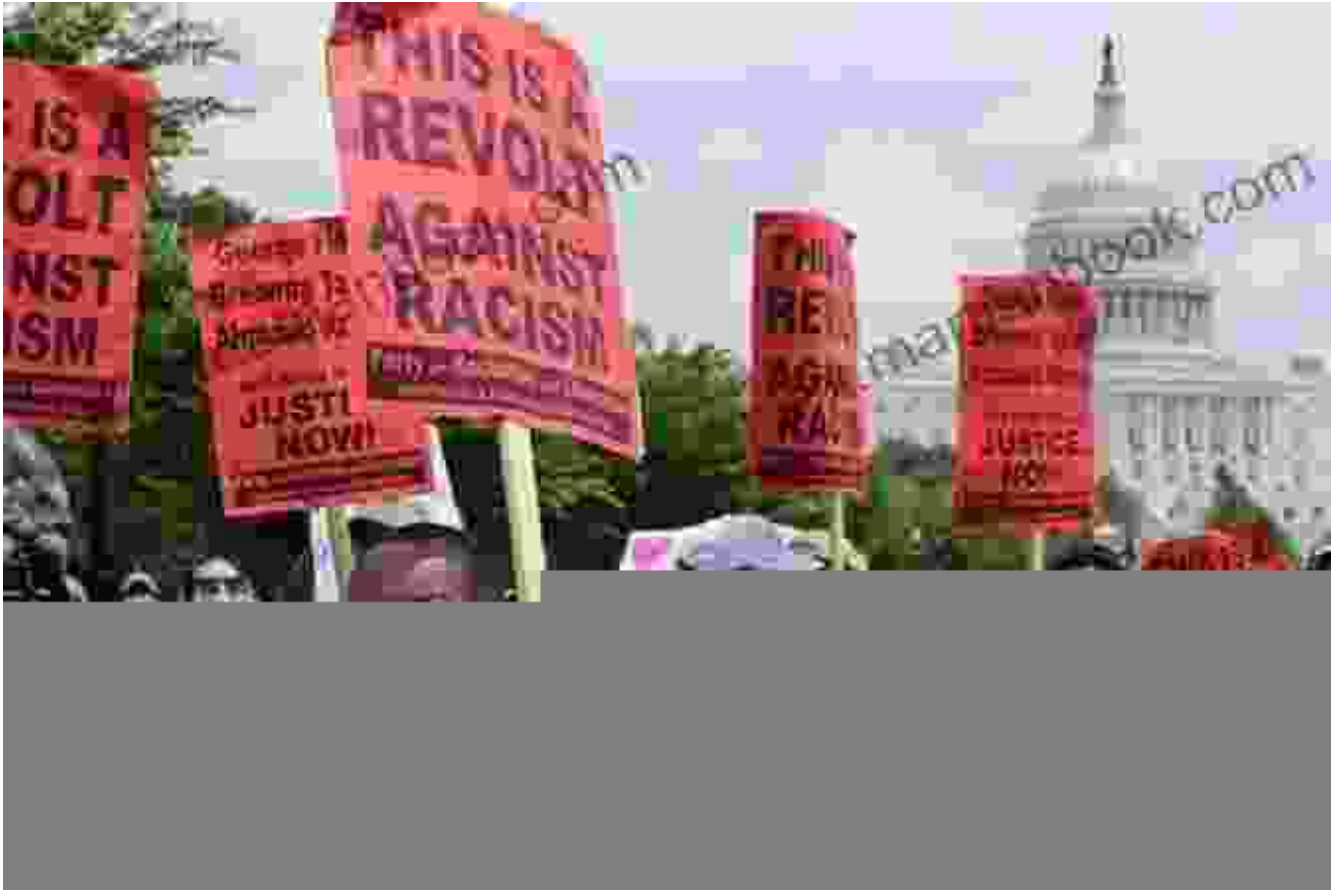
A Civil Rights protest, with people marching and carrying signs