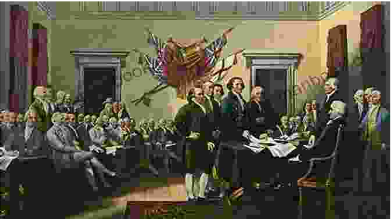
The Declaration of Independence, signed by the founding fathers

The American Revolution marked a watershed moment in American history, not only in terms of political independence but also in the way the past was understood. Patriots and revolutionaries invoked the ideals of liberty, equality, and self-determination, casting themselves as the inheritors of a glorious tradition of resistance to tyranny. This narrative, enshrined in the Declaration of Independence and other founding documents, became a cornerstone of American national identity.