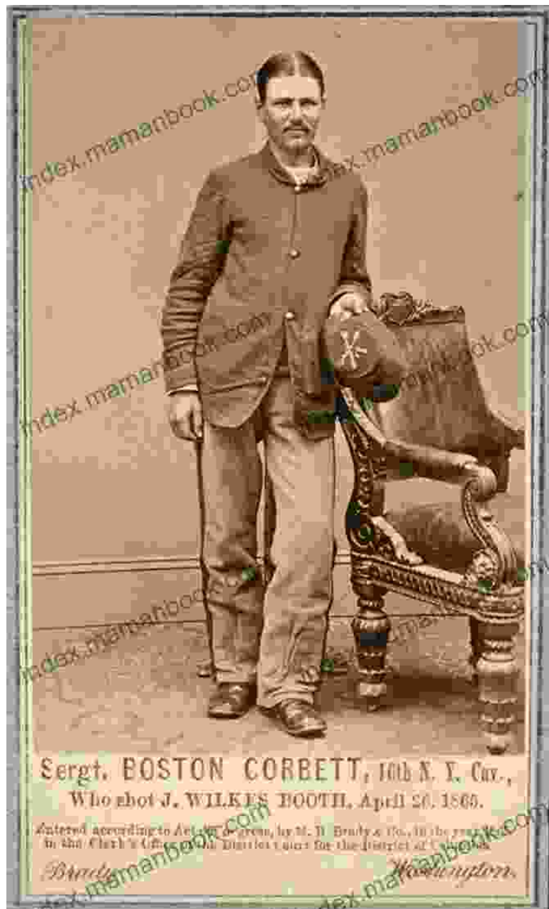
Sergt. BOSTON CORBETT, 10th N. Y. Cav., Who shot J. WILKES BOOTH, April 20, 1865.

Entered according to Act of Congress, by M. H. Brady & Co., in the year 1865, in the Clerk's Office of the District Court for the District of Columbia.