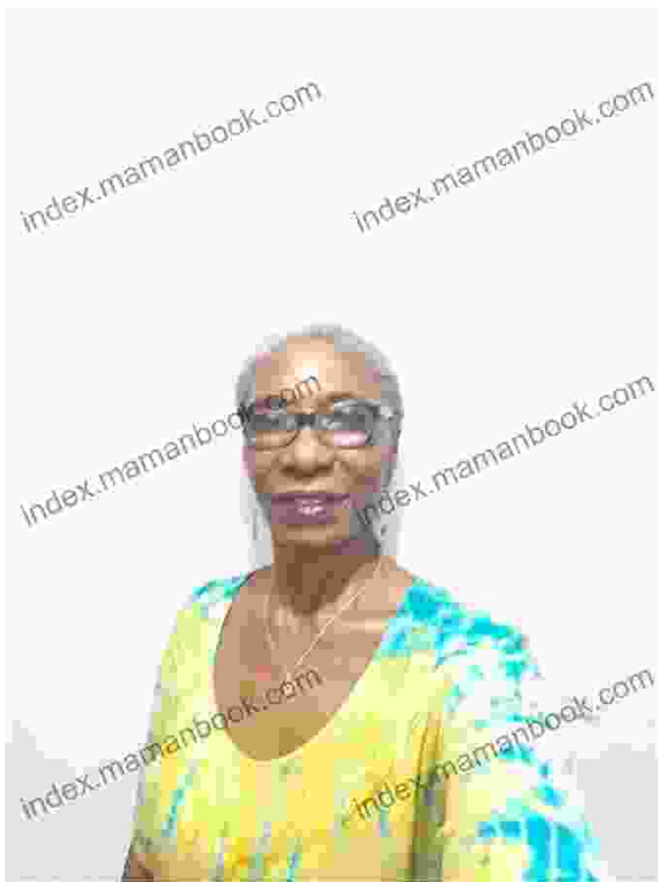
Eunice Cecelia, the protagonist of the contemporary narrative in Woken Without Warning

reverberate in the lives of those who came after. Asibika's manuscript becomes a window into the horrors of slavery, exposing the brutality, violence, and dehumanization that shaped the lives of countless individuals. Eunice's experiences, in turn, highlight the ways in which racial inequality and the legacies of colonialism persist in contemporary society.